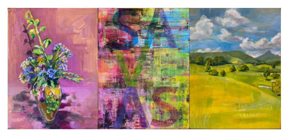
Still-Scape: Tweed Weeds #11 - Save As 2023. 40 x 92 cm

In an Unnatural History she uses this expanded still life format to link together ideas about visual perception and environmental science. Within each of the works in 'The Meaning of (Still) Life', she presents a narrative around a local endangered species. In 'Still-Scapes' the paintings trace a parallel loss of biodiversity as a result of invasive flora. The stylistic shifts in these works employ wit and colour alongside signs and symbols capable of engaging a broad audience to appreciate 'the impact of urban life on the planet'. 1